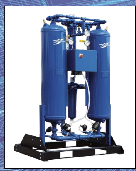
Regenerative Desiccant Air Dryers