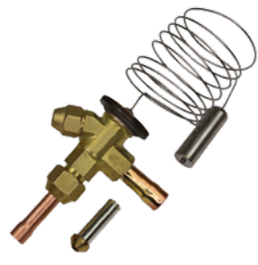
Interchangeable orifices specifically match system design to refrigeration load.

Thermostatic expansion valve that modulates refrigerant flow to match system requirements in fluctuating ambient temperatures and compressed Low cost capillary tube air load. systems used by other manufacturers will increase or decrease refrigerant flow based upon ambient conditions with no regard to system load. High ambient clogged temperatures or slightly condensers will increase refrigerant flow without a load to balance the system. Operation under these conditions can cause premature compressor failure.