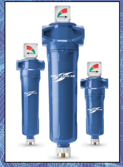
Compressed Air Filtration